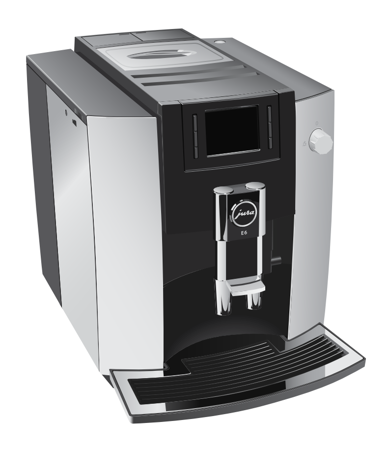
E6 – Quick Reference Guide