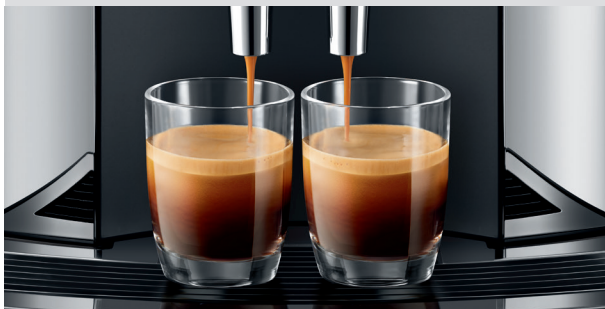
The P.E.P. Function for Barista Espresso Quality