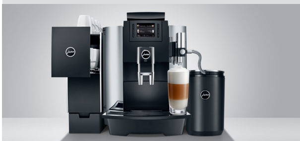
As individual as your requirement - with JURA Accessories