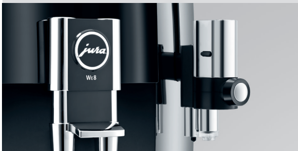
The Fine Foam Frother G2 assures feather light foam