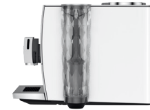
15239 ENA 8 Nordic White

In four Colors - White, Red, Black and Aluminium