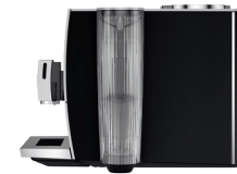
15253 ENA 8 Metropolitan Black