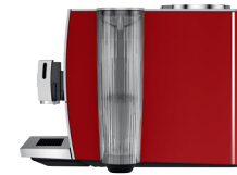
15253 ENA 8 Sunset Red