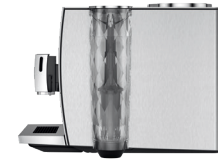
15222 ENA 8 Massive Aluminium The Signature Line Machine